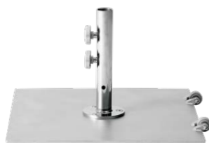
30KG PREMIUM WHEEL BASE