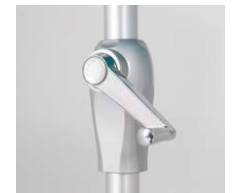
DURABLE WINDER SYSTEM