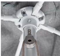
DURABLE STAINLESS STEEL PULLEYS & FIXINGS