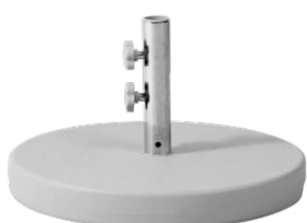
30KG CONCRETE FILLED BASE

You can either use your umbrella with a freestanding base or instead install it using our stainless steel Removable Spigot System. The base plate is bolted down to a timber deck or a concrete patio and the removable spigot is then fixed to the base plate.