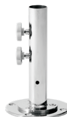
REMOVABLE SPIGOT SYSTEM For installation onto a wooden deck or concrete patio.